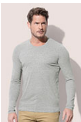
ST9620 Clive Long Sleeve