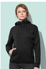
ST5940 Recycled Scuba Jacket